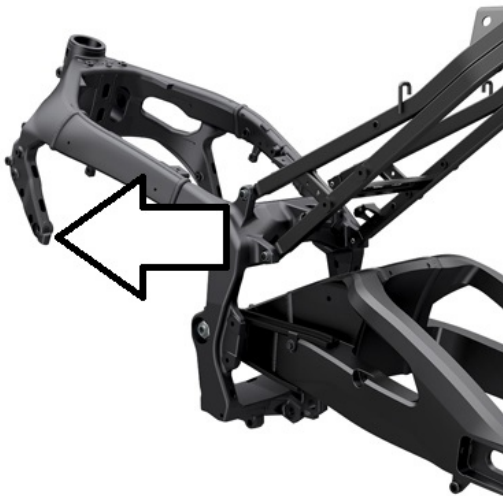
Assembly positions (both sides)

year of production: '16- product code: SR169