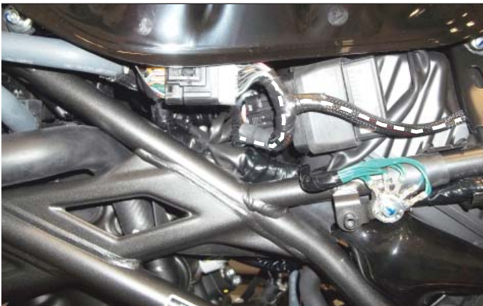
CONNECT TO ECM