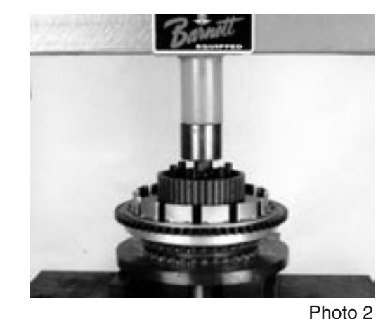
(Continued on back)

Using a press install the Barnett Scorpion Clutch hub into the OEM clutch hub basket. Securely support the inner bearing races during this process. Carefully bottom the Scorpion Clutch hub In the OEM basket. After pressing the Barnett Scorpion hub, check the bearing for smooth ness again! Refer to photo 2.