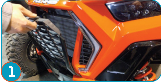
Remove grille from vehicle.

***NOTE: Prior to installation, please verify if a revised version of this instruction sheet is available on proarmor.com .***