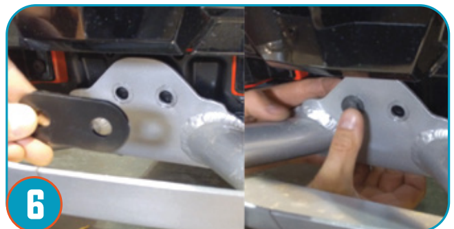
Place provided spacer between lower mounting plate of the bumper and the frame & hand tighten 2 M10 bolts.