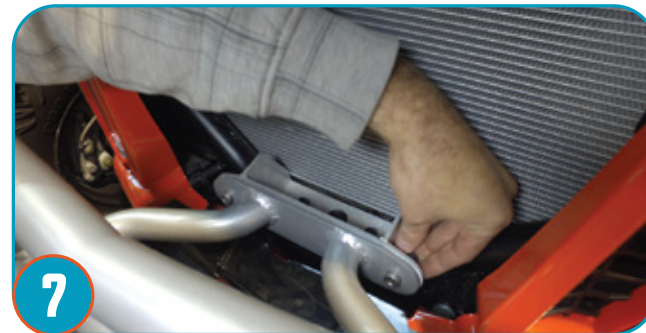
Hand tighten 2 M8 bolts to chassis bracket installed in step 3.