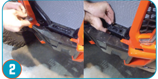
Place PEM plate under frame as shown, hand tighten center M8 bolt.