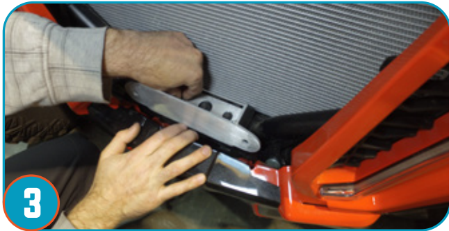
Place provided chassis bracket as shown on top of frame and hand tighten outer 2 M8 bolts.