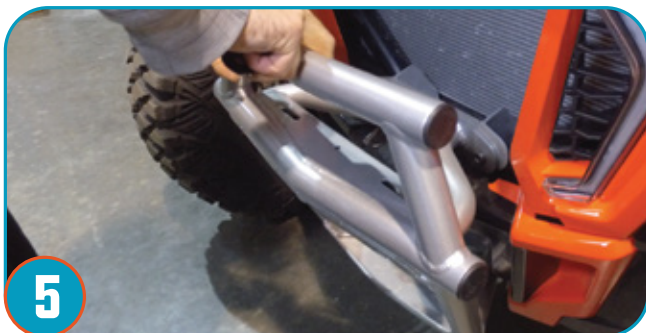
Position bumper on vehicle. Hook the top mounting plate over plastic.