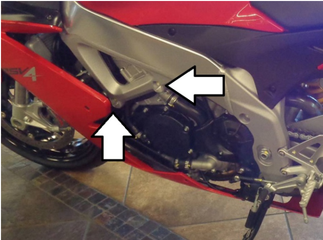
Assembly positions. Left and right sides

year of production: ALL product code: SR223