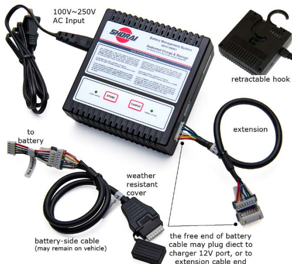
Shorai BMS01 Charger/Storage System