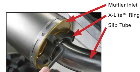
V.A.L.E.™ Assembly Detail