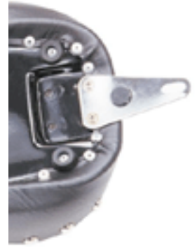
Bracket shown in Dyna Wide Glide Position