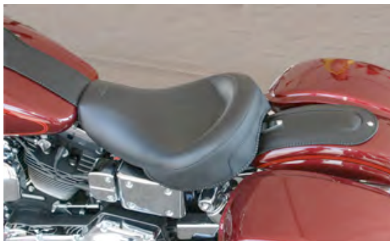
Solo with matching fender bib