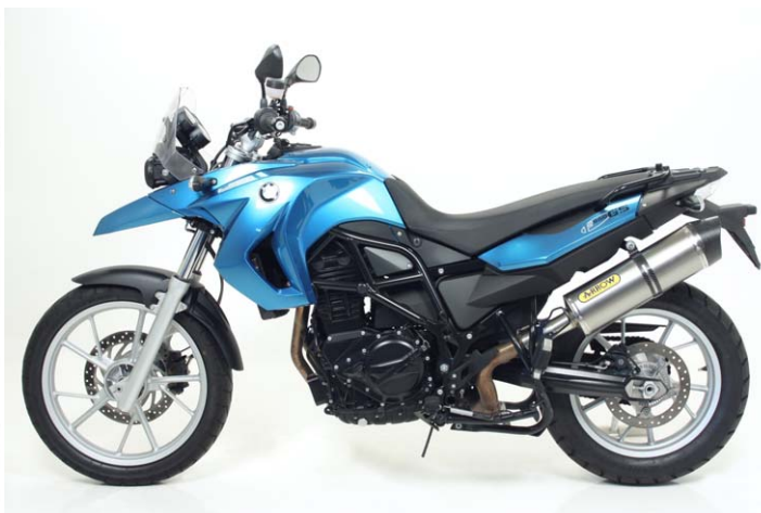
TERMINALE MAXI RACE-TECH