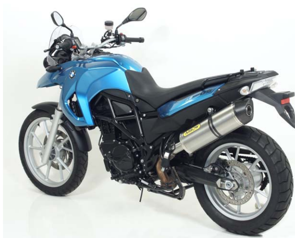
MAXI RACE-TECH SILENCER