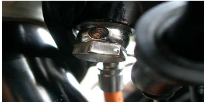
A2 (MASTER CYLINDER)