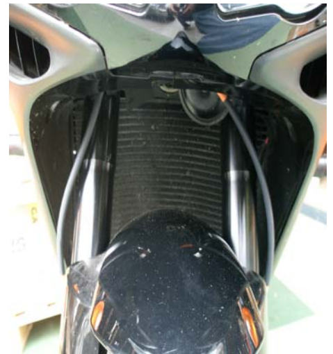
A5 (FRONT VIEW)