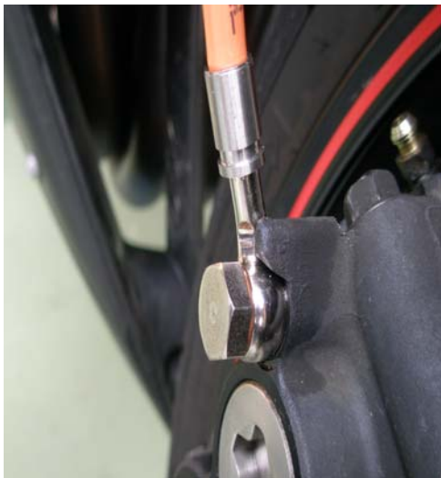
A6 (RIGHT CALIPER)