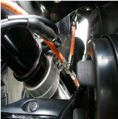
A3 CENTER OF FAIRING STAY