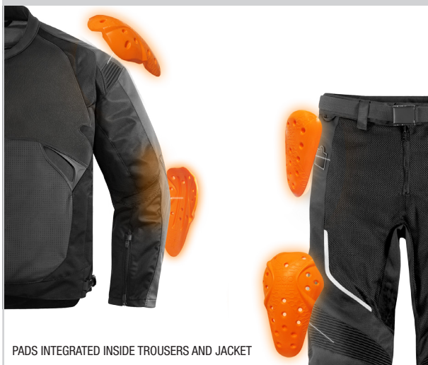
PADS INTEGRATED INSIDE TROUSERS AND JACKET