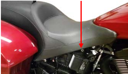
8mm Allen Bolt on each side of the frame