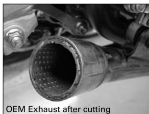
OEM Exhaust after cutting