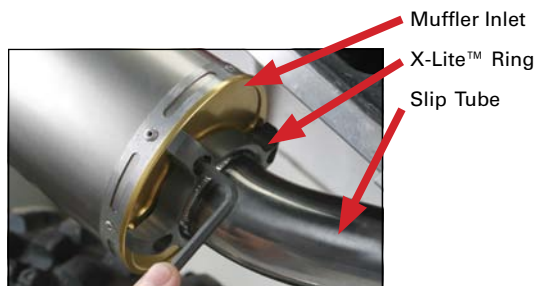
V.A.L.E.™ Assembly Detail